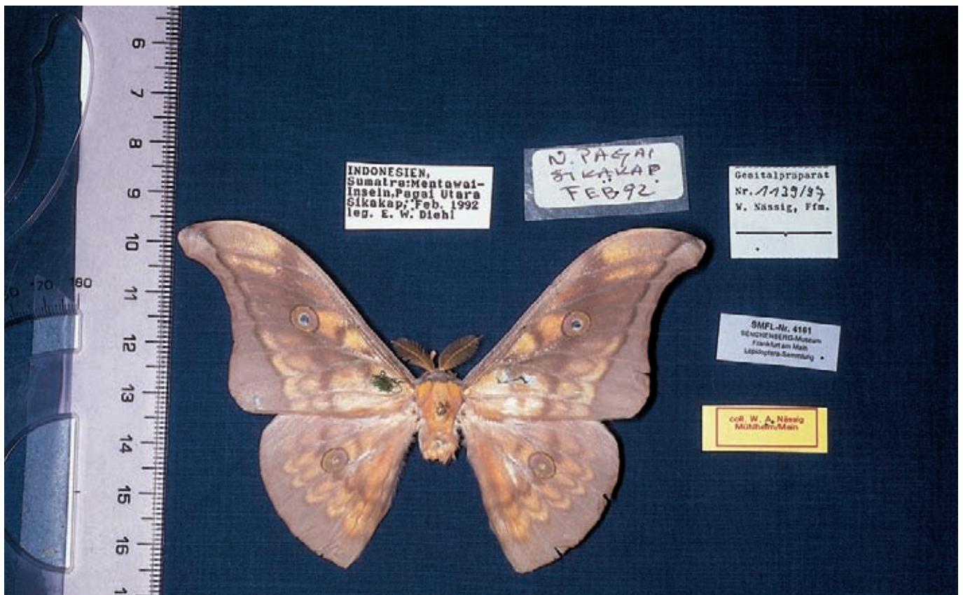
Fig. 1: Holotype \sigma of Antheraea (Antheraea) mentawai NÄSSIG, LAMPE & KAGER, 2002. For color pictures of the other \sigma specimen and the two \text{♀♀} , see NÄSSIG et al. (1996: 103, figs. 81, 82.a, 82.b). — Photograph W. NÄSSIG.

Holotype: \sigma , “Indonesien, Sumatra: Mentawai-Inseln, Pagai Utara, Sikakap, Feb. 1992, leg. E. W. DIEHL”; GP (dissection no.) 1139/97 W. NÄSSIG/Senckenberg, SMFL-no. 4161 (Fig. 1). Ex coll. W. A. NÄSSIG/HSS in the collection of the Senckenberg-Museum, Frankfurt am Main.